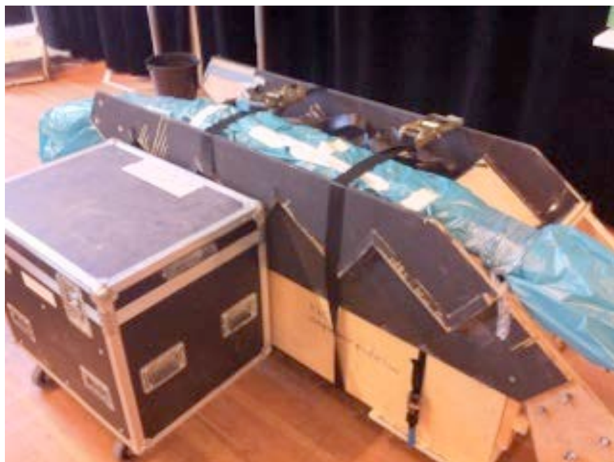
on tour +1x suite case